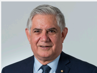
The Hon Ken Wyatt AM, MP Minister for Aged Care Minister for Indigenous Health